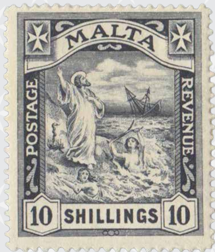
10 Shillings Black Issued on 6 March 1919 Watermark: Multiple Crown CA Adapted from an engraving by Gustav Dorè