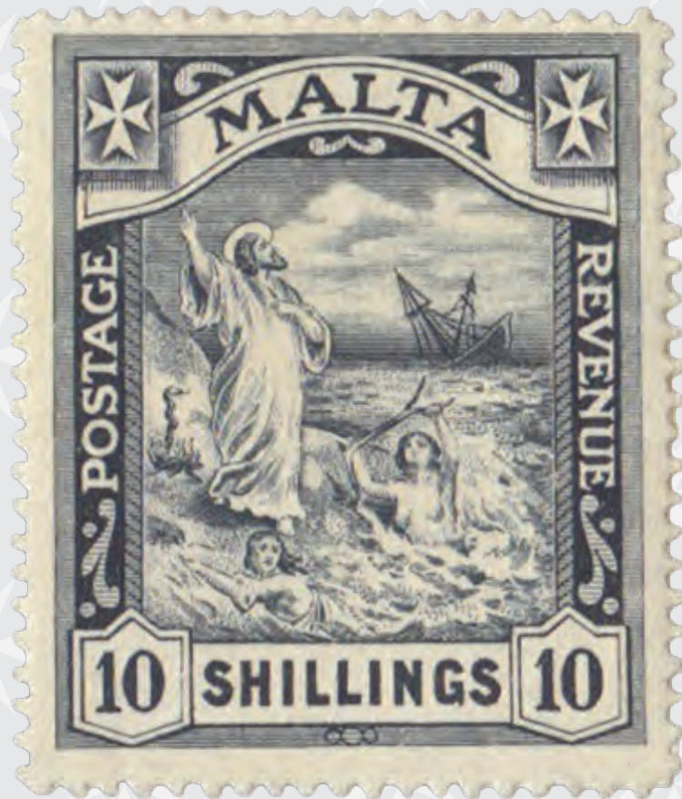
10 Shillings Black Issued on 6 March 1919 Watermark: Multiple Crown CA Adapted from an engraving by Gustav Dorè